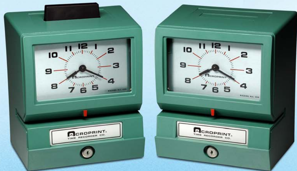
Model 125 MANUAL PRINT