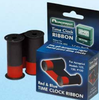
Model 150 AUTOMATIC PRINT