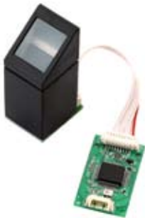
SFU500 (OEM version)