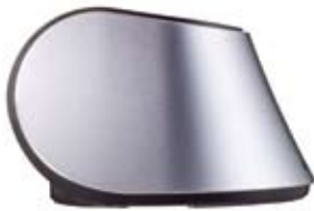
BioMini Plus Side View