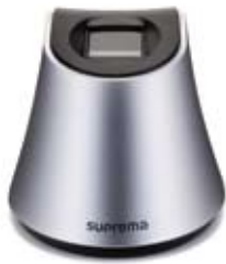
BioMini Plus Front View